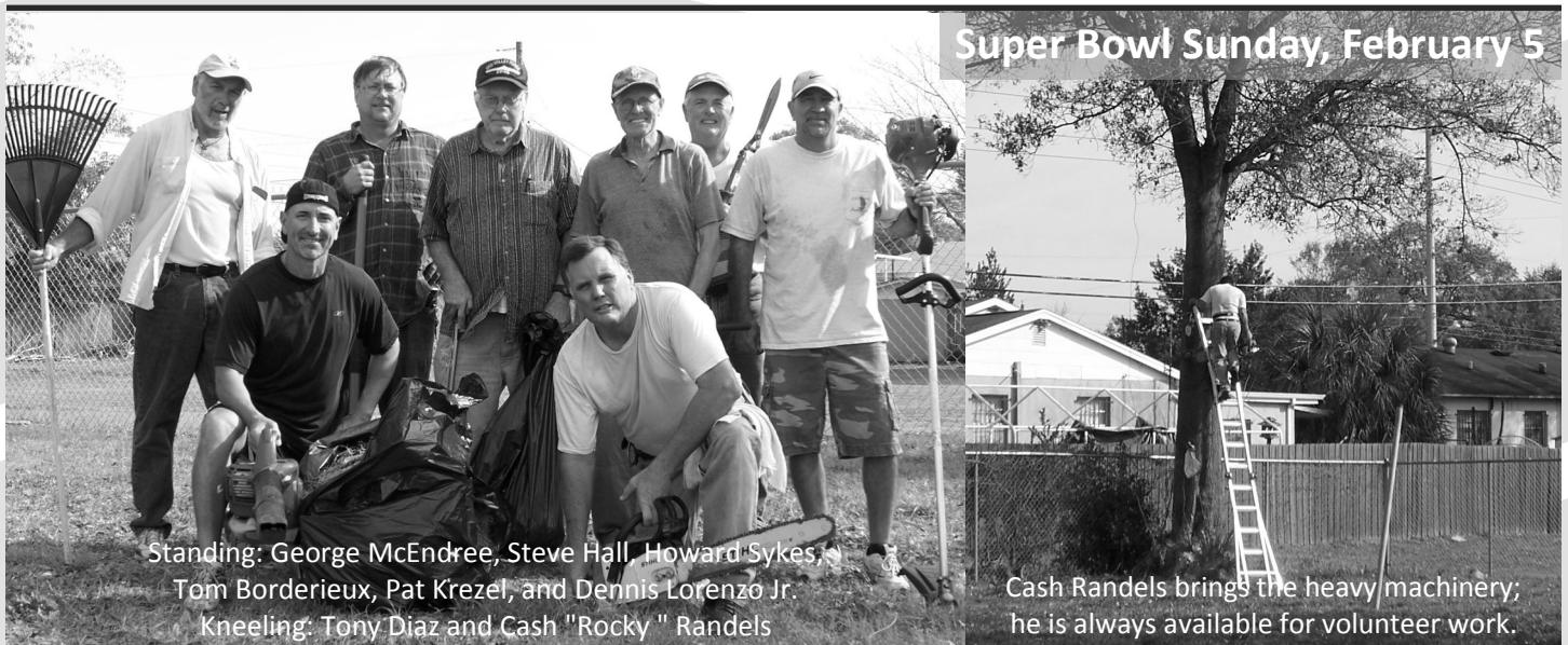
Super Bowl Sunday, February 5